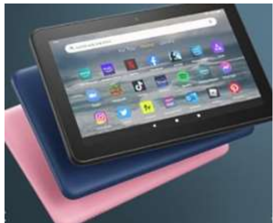
Image of Tablet with Ai Assistance on it Tablet includes cell phone chip, wireless to laptop, desktop, TV, projector, large screen display, printers, cameras and any digital device. Its will focus on voice commands to Ai that can navigate anything, video conferences, drawing, scheduling and writing. It uses existing phone and Internet technology with Agentic Automation.

Assume, one million people live within one mile of the 14-mile route from Denver to Golden. Then 100,000 subscribers (10%) paying $100 per month or $1200 pr year will generate $120,000,000. If we use 70% for expenses and 6.3 % for debt service, this leaves 24% for net surplus or profit. One half goes to capital and the other ½ goes to the partnership between Bingham Labs and Partners. The Commercial technology will be next after this one is up and running. It will need to be more robust, faster and serve a bigger audience including business, banking, energy, universities, military, manufacturing, travel, construction and hospitals/clinics- the new oil.