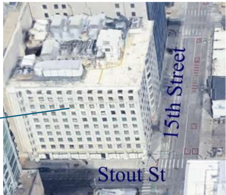
Data Center Headquarters for CoreSite